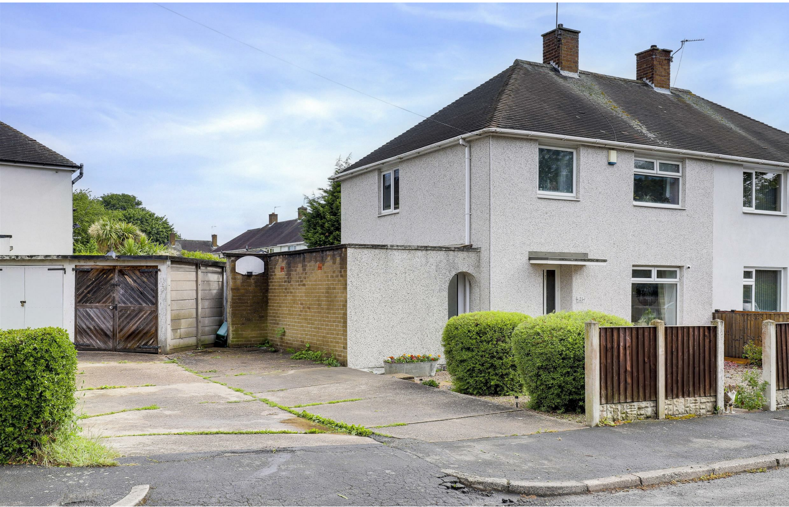
Tamworth Grove, Clifton, Nottinghamshire NG11 8JB